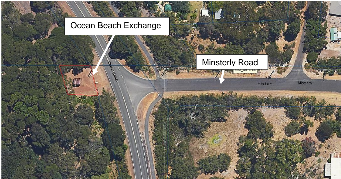
ABOVE: Lot 8171 on Deposited Plan 30137 (No. 466 Ocean Beach Road, Ocean Beach)